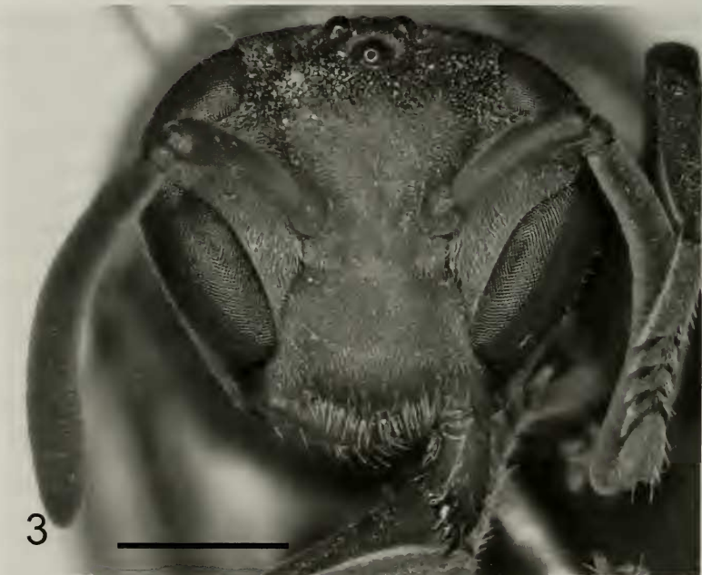
Figs 1-8. Continued.